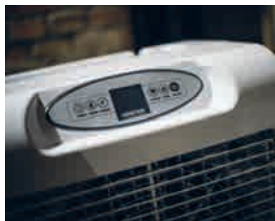
CCX 4.0 control panel